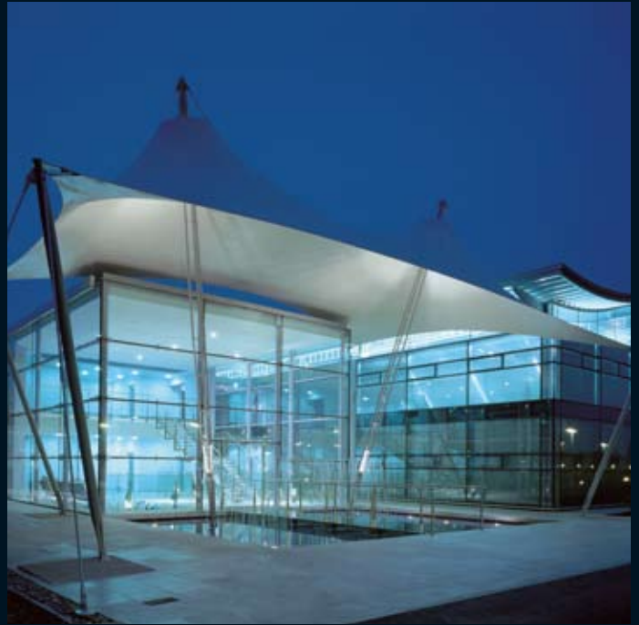
THE DYSON RESEARCH, DESIGN AND DEVELOPMENT FACILITY IN WILTSHIRE, UK.