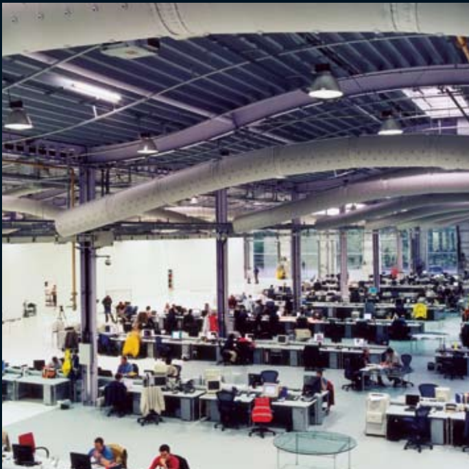
DYSON ENGINEERS WORK IN A BUILDING THE SIZE OF 30 TENNIS COURTS.