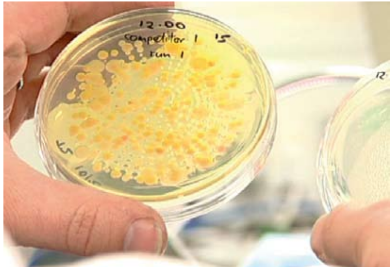
BACTERIA FOUND IN COMPETITOR HAND DRYER AIRFLOW