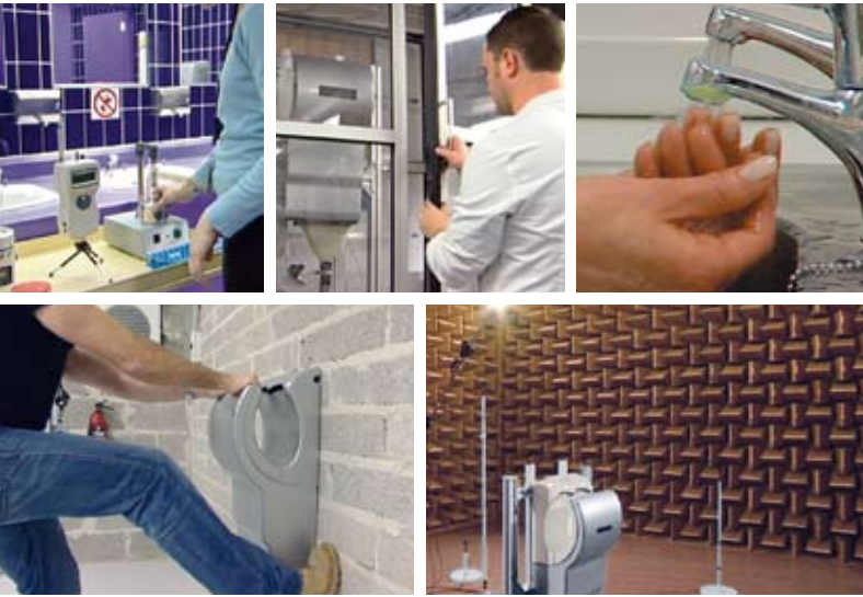
TESTED, TESTED AND TESTED AGAIN FOR OVER 8,000 HOURS