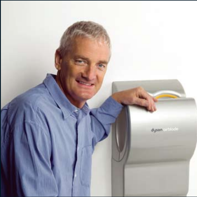
JAMES DYSON THINKS EVERYDAY TECHNOLOGY SHOULD WORK PROPERLY.