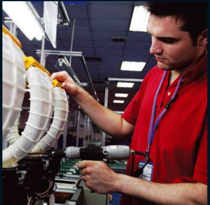
THE AIRBLADE™ HAND DRYER IS ENGINEERED TO REDUCE NOISE GENERATED IN USE.