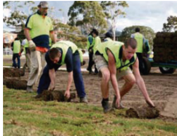
Green purchases for Glen Eira included drought resistant grass for sporting grounds

Electronic central control, moisture sensors and drip line irrigation upgrades on sports ovals were also added to the mix. The program overall has resulted in Council managing to irrigate a greater number of ovals - an increase in area of approximately 15% - with the same allocation of water.