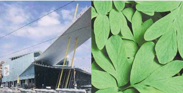
Left: Melbourne Exhibition Centre